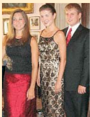
Bel Canto Institute Singers

Returning favorites for the Year of Sembrich include: