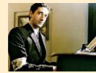
Adrien Brody in "The Pianist"