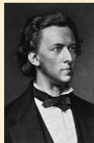
M. Frédéric Chopin